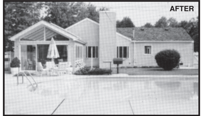
AFTER: New Roof System Offers Better Water Drainage and Updates Appearance Of The Home

VISIT US ON THE WEB AT: www.fanninremodeling.com