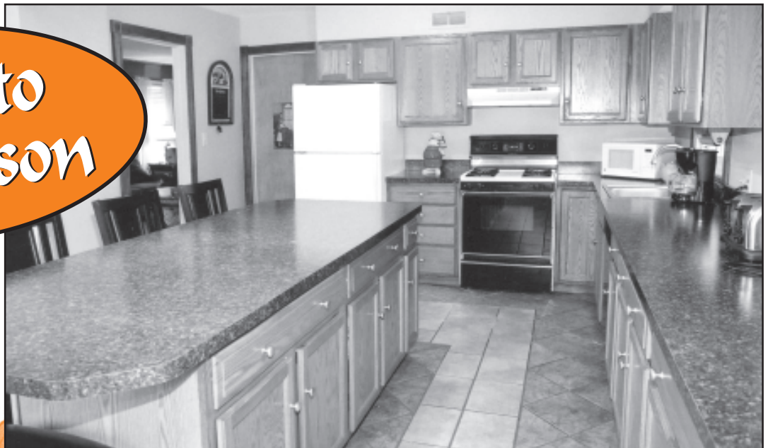
A 1940's home with a very contemporary and modern kitchen. (See story on page 2)

Stepping into a newly remodeled kitchen or family room can bring back the same feeling of excitement and joy most of us experienced as children. Remember the first pile of fall leaves your mom, dad or Grandpa raked together and the feeling of excitement as you waited for them to finish so you could jump into them. What a thrill!