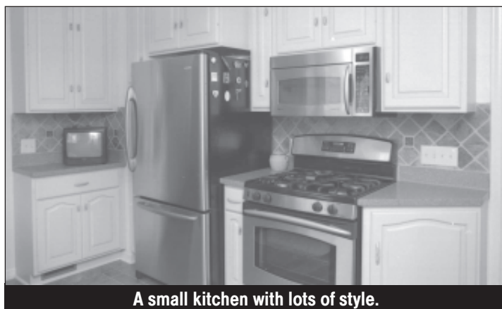
A small kitchen with lots of style.

The first homeowner had been renting her family home due to a job transfer out of state. She was excited to move back to her neighborhood and was looking forward to having the kitchen she had always