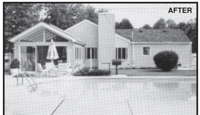
AFTER: New Roof System Offers Better Water Drainage and Updates Appearance Of The Home