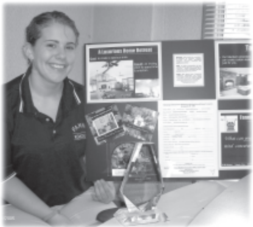
by Beth Grafing, Defiance College Intern