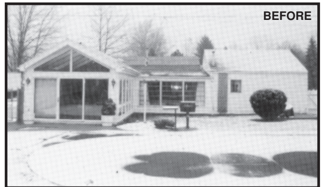
BEFORE: Exterior Flat Roof